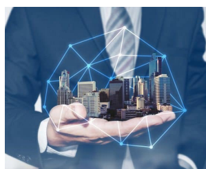
CONTROL AND CONSTRUCTION