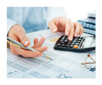
INVESTMENT AND PORTFOLIO MANAGEMENT